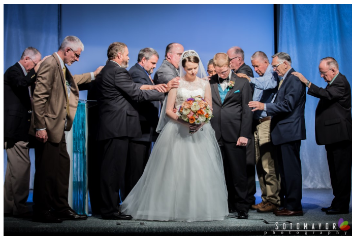
The Prayer of Leaders!