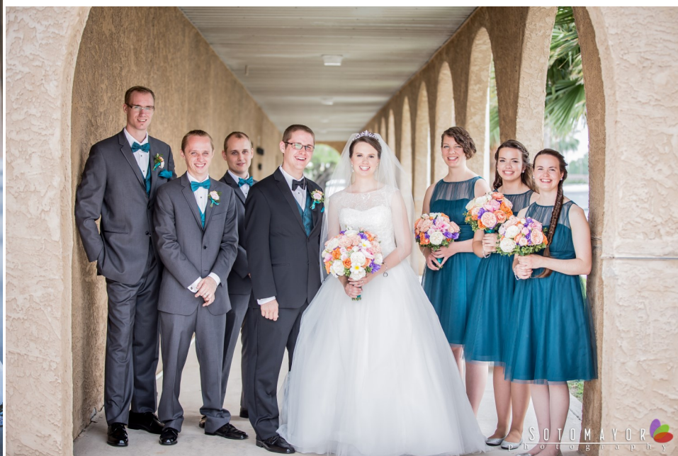
The Awesome Bridal Party!