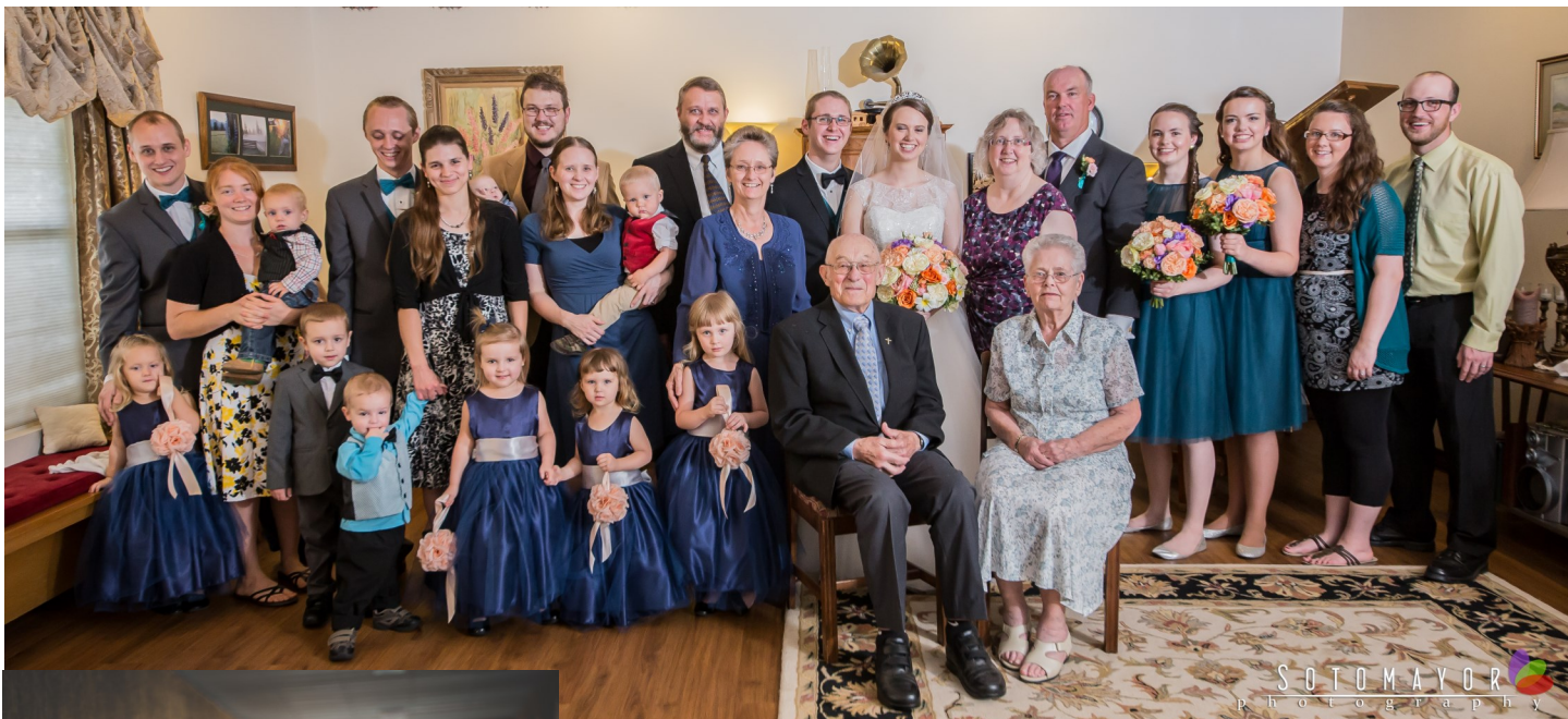
The New, Bigger, Better Family!