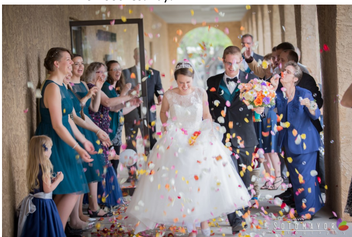
The Great Escape!