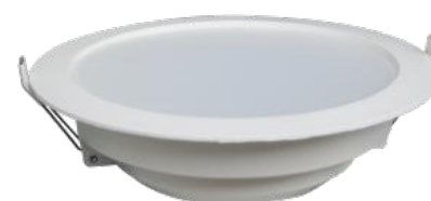
Model SD1507: 25W, 30W