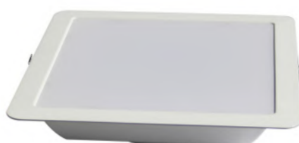
Model SD1508: 30W