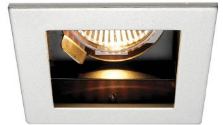
DL251 L.90 W.90 H.115mm