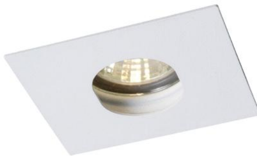
DL207 L.86 W. 86 H.90mm