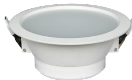
Model SD1506: 8W, 12W, 15W, 20W, 25W