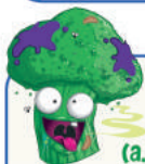
MOSTLY A'S? SHOCCOLI (a.k.a. Doc Brocc)

He may have a wilted head and an offensive smell, but Doc Brocc still fancies himself the brains of the gang – and considering the other members, who are we to argue? Constantly tinkering on new insane inventions using stuff he scavenges from the store, Doc never fails to whip up miracles of mad science just as all hope seems lost – or zap himself silly when he flicks the switch!