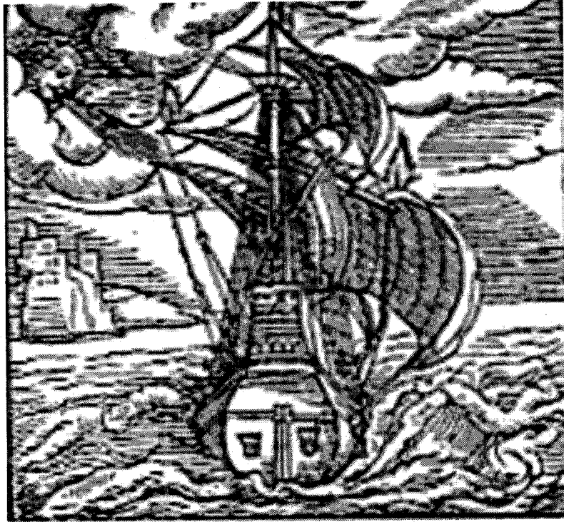
The Ship Image from Lo Spaccio de la Bestia Trionfante