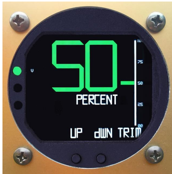
1: Display head for Pitch Trim system

The Pitch Trim system provides immediate feedback as to aircraft pitch trim position and one-handed pitch trim control (via remote mounting switches on control stick). Trim changes inputs are routed to a unique linear servo which has an IP-54 rating.