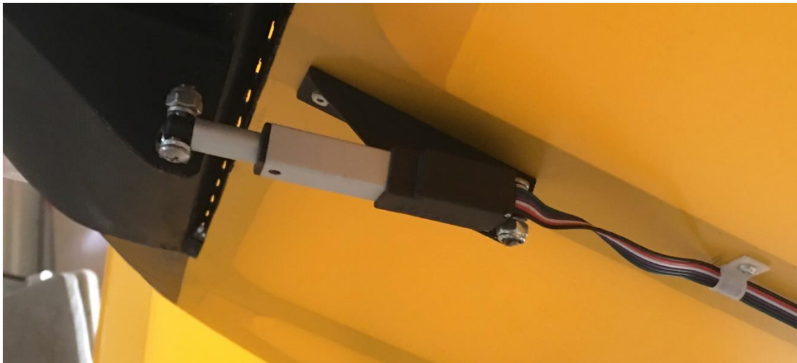
4: Typical servo installation on lower elevator