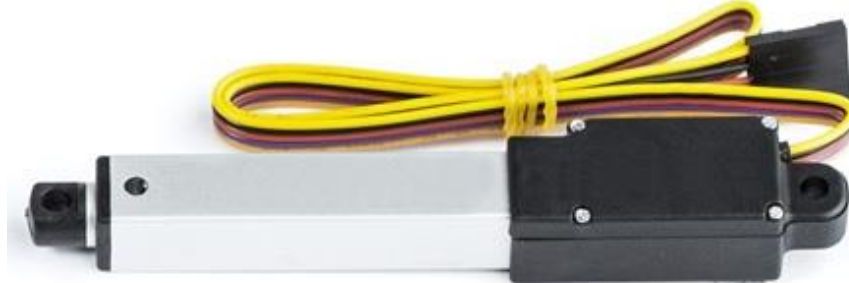
2: Linear servo