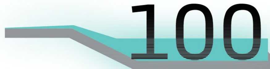
Some healthhuds mockups