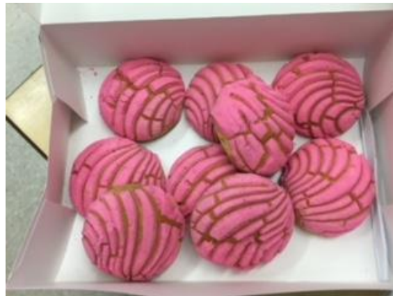
GUATEMALAN PASTRY PAN DULCE SAMPLING