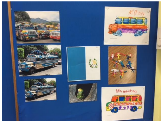
GUATEMALAN CHICKEN BUSES