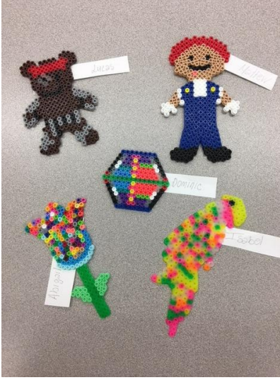
PERLER BEAD CREATIONS