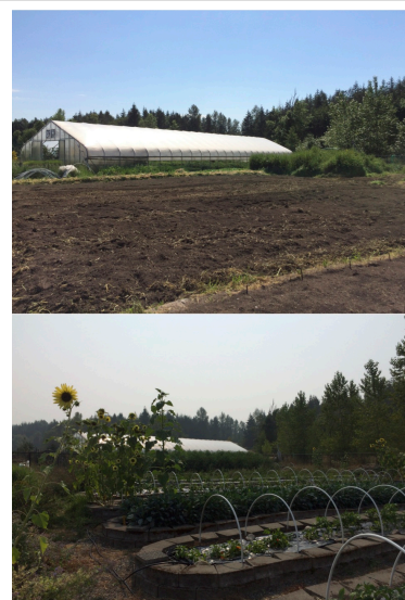
Stewart Organics Farm, Eatonville