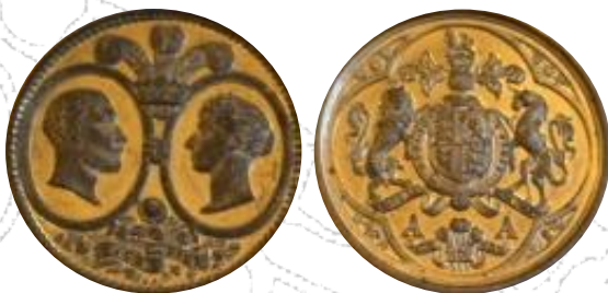
Prince of Wales and Princess Alexandra 25th Anniversary 1888