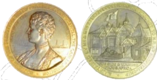
Boer War 'Princess Alexandra Nursing Home' Surbiton