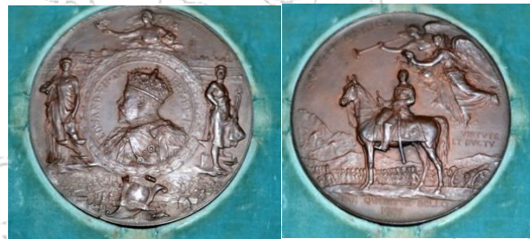
Boer War 'British Empire Medal' 1901 by Spink

Princess Alexandra's Private Military Hospital in Surbiton in 1900. School attendance medals were also very popular and were issued and presented by many schools, although for some reason none are known for Ireland.