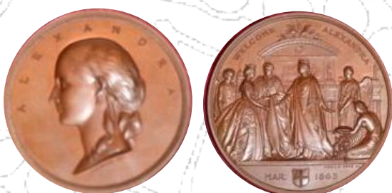
Arrival of Princess Alexandra to London 1863