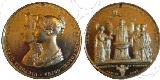
Christening medal for Albert Edward 1842

The subject of his presentation for the evening was rise in the production of commemorative medals and medallions, beginning during the early years of Queen Victoria's reign to its peak in the reign of Edward VII and its gradual decline in the reign of George V.