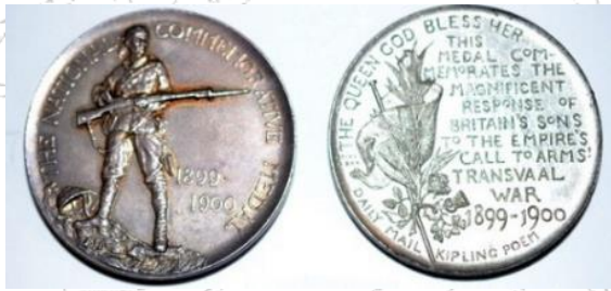
Boer War Medal by Spink for raising funds for the wounded

Edward and Alexandra's wedding anniversary in 1888, and special note was made of Victoria's 60th Anniversary in 1897 which portrayed the four generations of the Royal family - Victoria, Edward, George and David (Edward VII).