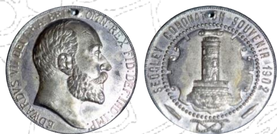
1902 Coronation Medal for Sedgley