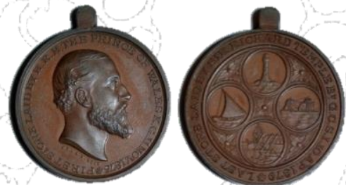
Opening of 'Prince of Wales Dock' Bombay 1880

The medals/medallions were produced in a wide range of metals and finishes from gold to white metal which provided a wide price range to suit all pockets. The market was not only supplied by British manufacturers, but also by a large number of European makers, especially German.