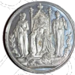
Canadian Coronation Medal