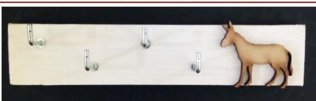
key ring rack - self adhesive