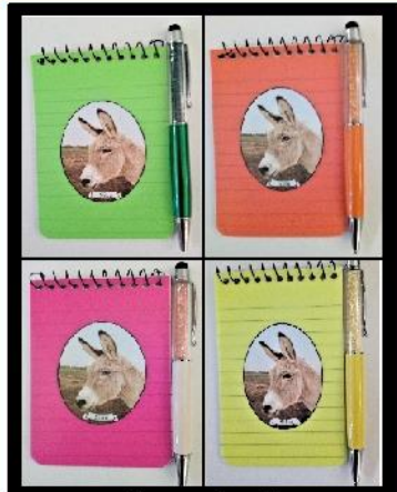
note book & pen