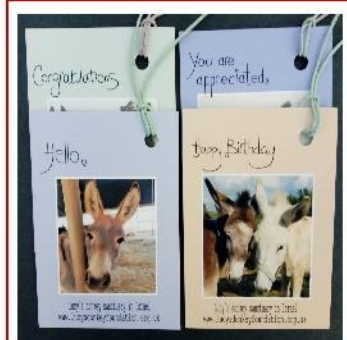
4 gift tags pack A

All items are hand made or hand assembled by supporters creating a unique charity product