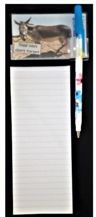
fridge magnet note pad & pen