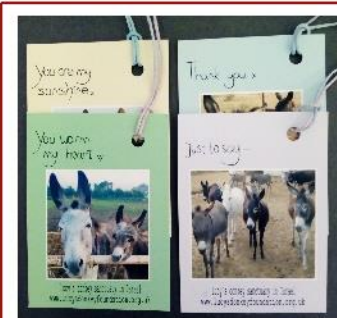
4 gift tags pack B