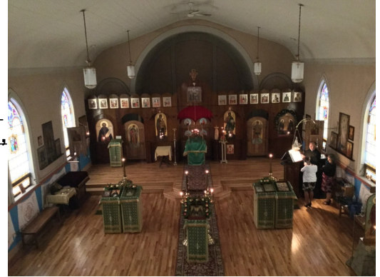
Ss. Sergius and Herman of Valaam Parish and Monastic Brotherhood