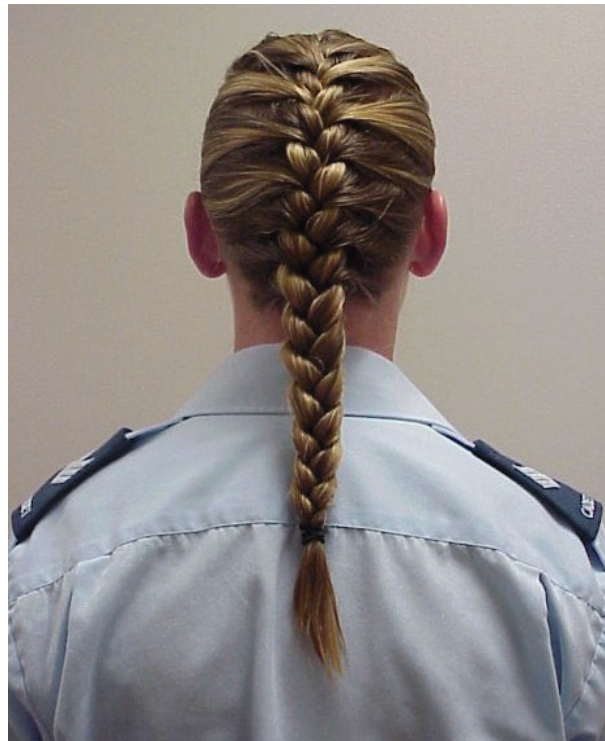
Hair - Female cadets (Braids) Cheveux - Cadettes (Tresses)