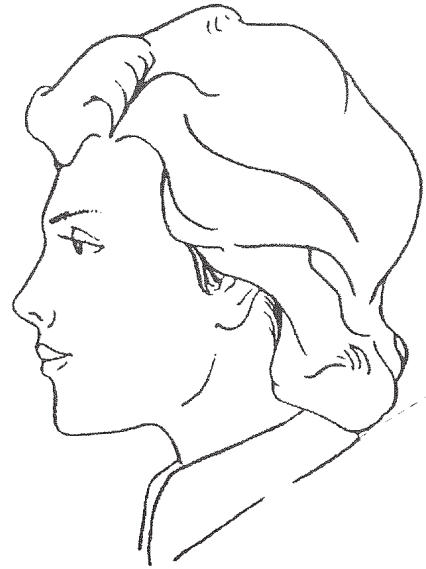
CURLED HAIR STYLE CHEVEUX FRISÉS