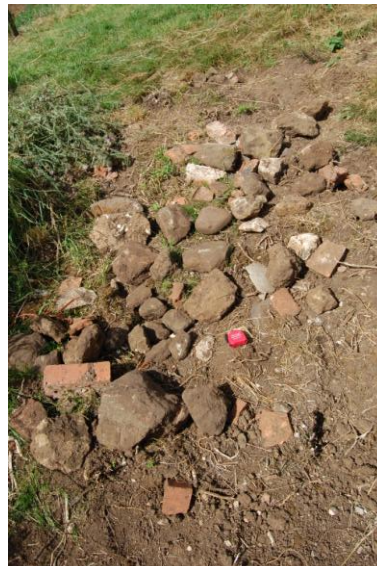
Building rubble found to the west (above) and the east (right) of the gateway to Sutterby Church

This material was recorded on 18 July 2015. The contents of the two groups were as follows: