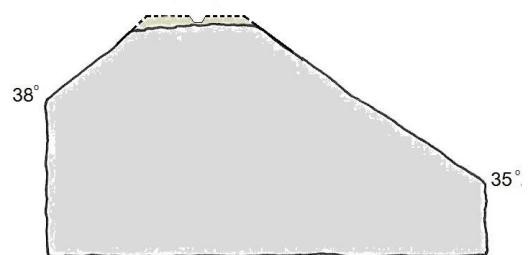
Profile of stone