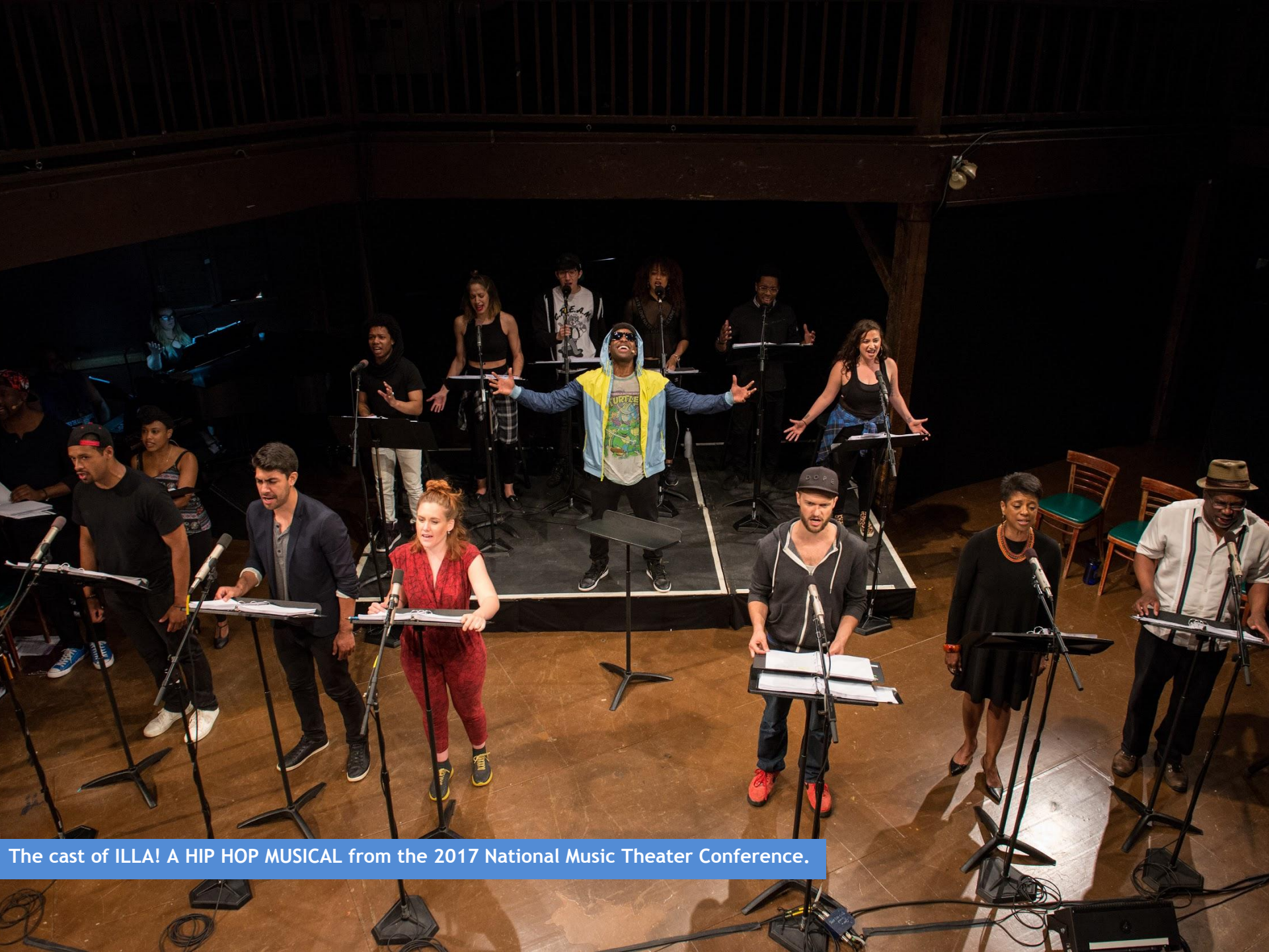
The cast of ILLA! A HIP HOP MUSICAL from the 2017 National Music Theater Conference.