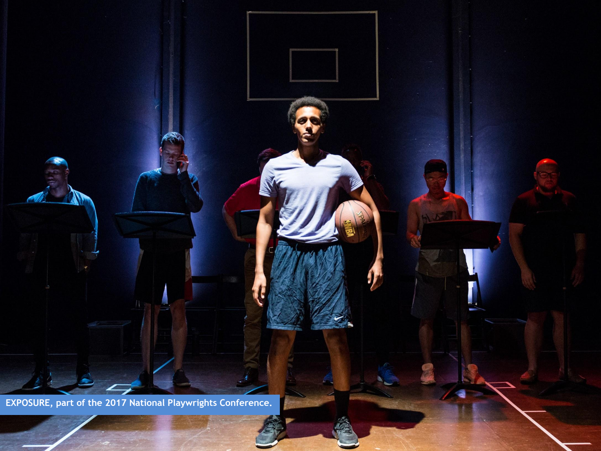
EXPOSURE, part of the 2017 National Playwrights Conference.