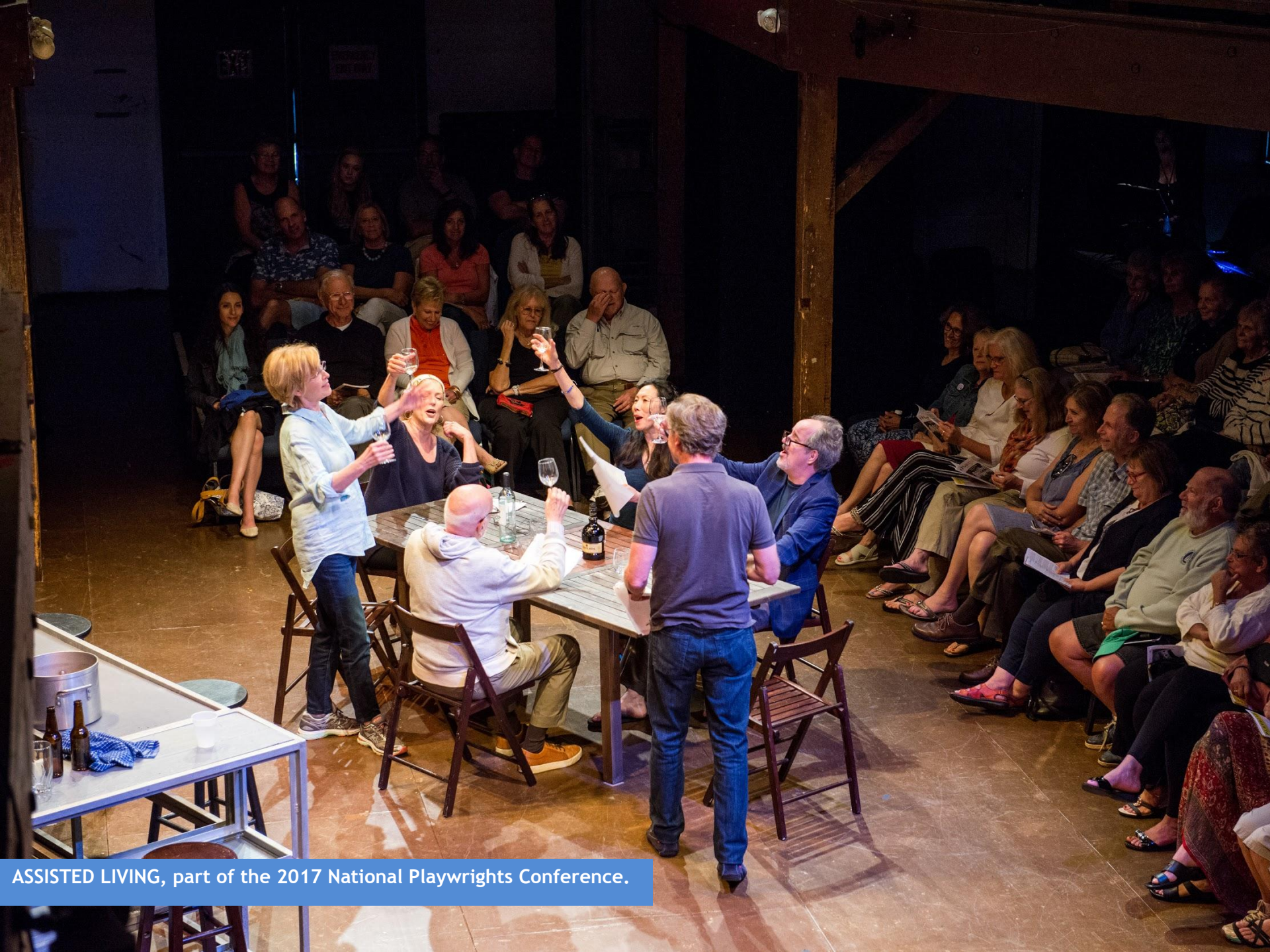
ASSISTED LIVING, part of the 2017 National Playwrights Conference.