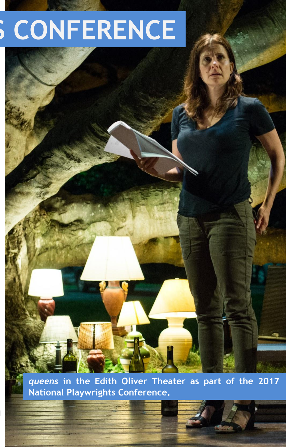
queens in the Edith Oliver Theater as part of the 2017 National Playwrights Conference.