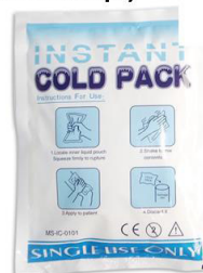
Instant Cold Ice Packs