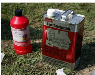
Camping Fuel, Zippo or Ronseal Lighter Fluid, & Charcoal Lighter Fluid