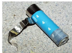
Lithium Batteries (Lithium Strips)