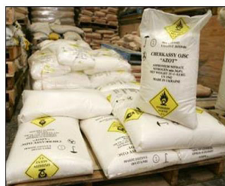
Ammonium Nitrate Fertilizers