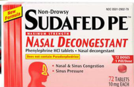
Pseudoephedrine or Ephedrine Based Products and packaging (Blister Packs)