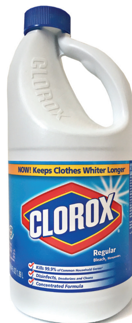
FIGURE 1. Typical Product Label An example of a chemical that has been mentioned for use in decontamination. Proper use of a chemical is guided by the label; note highlighted areas below including "directions for use" and "environmental hazards".

Based on the current studies presented here, the various constraints such as exposure time, concentration as well as knowledge of currently available chemicals, it is strongly suggested that use of chemicals in watercraft decontamination practice by the public are discontinued.