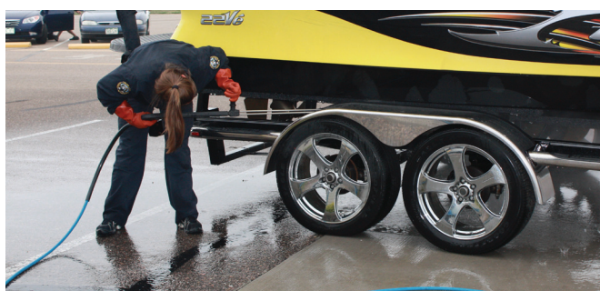
Watercraft inspection staff using hot water to decontaminate a boat.

Historically, chemicals have been a resource that managers, manufacturers and boat owners have turned to for decontamination needs. Often these chemical uses are a reflection of anecdotal experience and unpublished experimentation. Further, chemical use for watercraft decontamination presents its own suite of considerations for efficacy, impacts to the environment, the materials or equipment being treated, associated expense and human health and safety, as well as legal parameters. Finally, exposing watercraft materials to chemicals can alter the integrity of those materials, particularly with repeated use. Because of continued interest in chemical decontamination of watercraft, this document is meant to summarize the common chemicals referenced in watercraft decontamination.