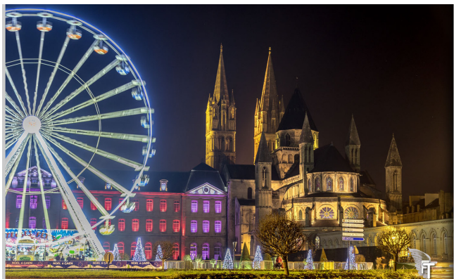
Caen - Hôtel de ville and Abbaye aux Hommes at Christmas

...Portsmouth European Cities Twinning Committee (ECTC) can help you!