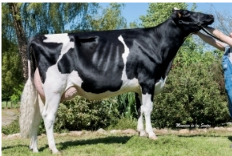
ARROXOS CURTIS HELIA S.A.T. Os Arroxos - Lugo CURTIS x MAGREBI