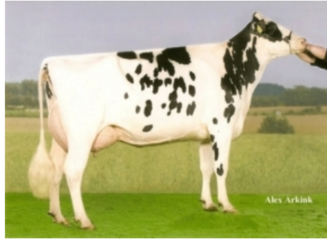
GIESSEN CINDERELLA 15