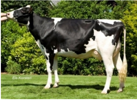
GIESSEN CINDERELLA 22