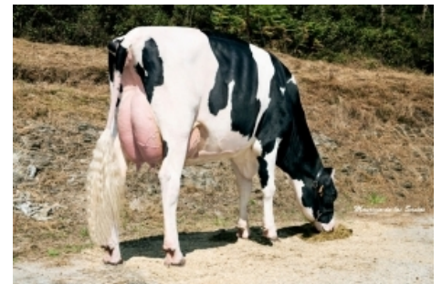
CALLOBRO CURTIS PICOLETA GZ Callobro Holstein - Lugo CURTIS x XACOBEO x VERTIGO x CHAMOSO