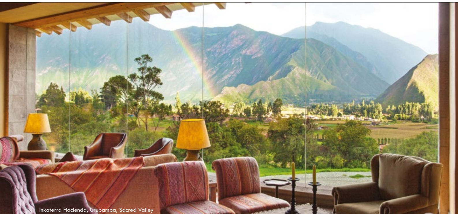
Inkaterra Hacienda, Urubamba, Sacred Valley