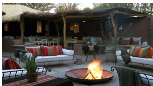
Clockwise from left: Hotel Patagonia Camp; Explora Rapa Nui; Awasi Atacama.

products. The Relais & Châteaux property offers biking through the vineyards and you can trek along the 500 hectares of nature trails in the Apalta Hills above the Residence. A winery tour and private tasting is also offered.