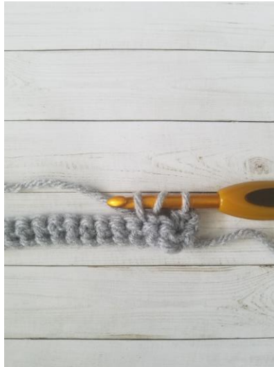
Fig 2: YO, draw up a loop for 3 loops on your hook