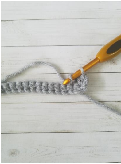
Fig 1: 1 sc in next st, sk next st, insert hook into the next st