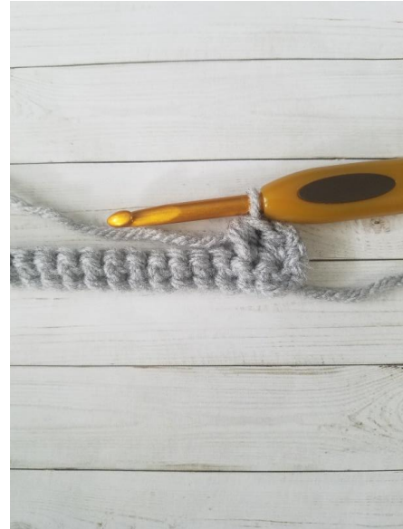
Fig 5: YO and pull through all 4 loops on the hook