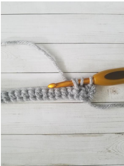
Fig 4: YO, draw up a loop for 4 loops on your hook