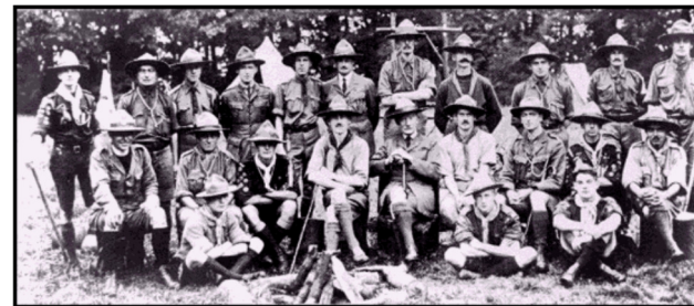
Baden Powell's First Course - September 1919