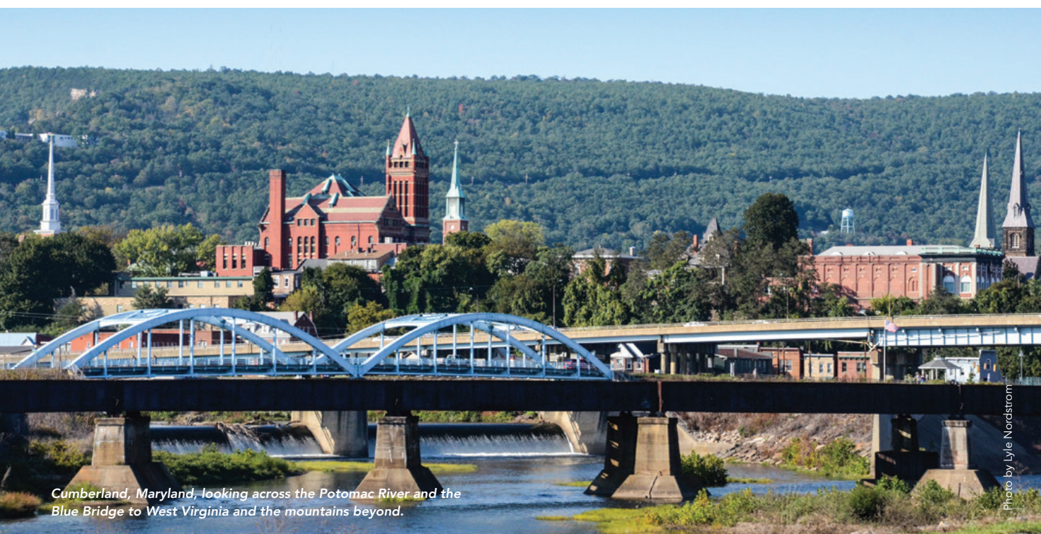
Cumberland, Maryland, looking across the Potomac River and the Blue Bridge to West Virginia and the mountains beyond.

”Mind you,” said Mullaney, “Cumberland is still no New York. But for Mountainside Baroque, that’s a good