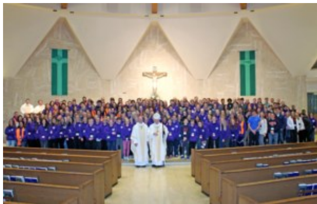
Bishop Shawn McKnight and Bishop Emeritus Gaydos pictured with the 2018 pilgrims for the March 4 Life.

Click here to access the shared Google Drive Folder (you may need to open this link in Chrome if your browser is having problems). This folder contains numerous resources to use in any catechetical setting.