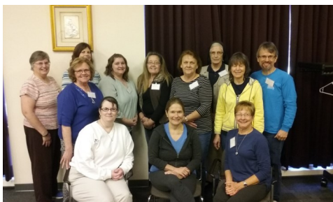
Jefferson City Workshop

A sincere thanks to all the youth ministry leaders, catechists, DRE's, and volunteers for a wonderful series of workshops this past month. 34 youth ministers representing 22 parishes from all corners of our diocese participated in our second round of Lead and Follow workshops focused on effective ministry in the youth setting. Participants learned about reaching youth as learners and believers, planning strategies and practices, approaches to prayer, and the importance of pastoral care. More importantly, participants got to connect with other youth ministry leaders from across the diocese and grew in their mutual support for one another in this ministry we all share. Keep an eye out for the next round coming later in 2018!