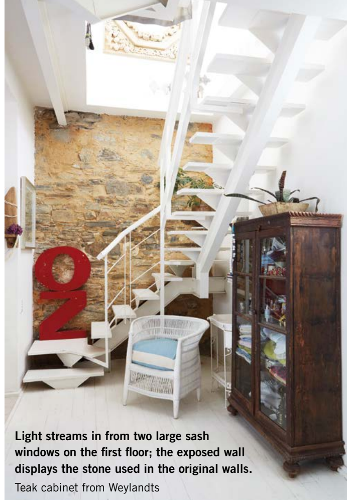
Light streams in from two large sash windows on the first floor; the exposed wall displays the stone used in the original walls. Teak cabinet from Weylandts