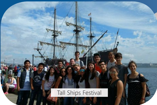
Tall Ships Festival