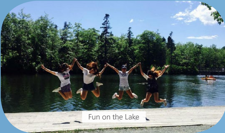
Fun on the Lake