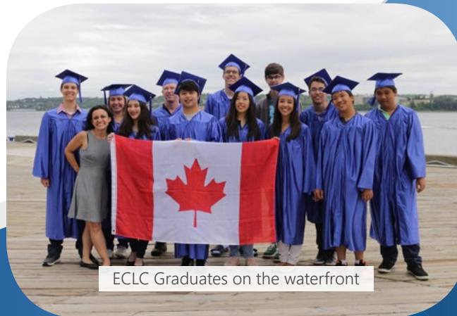
ECLC Graduates on the waterfront