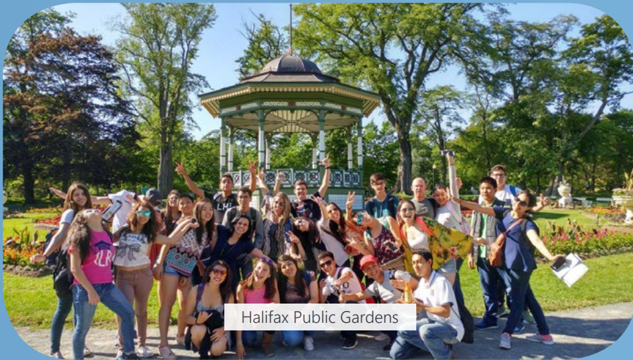
Halifax Public Gardens