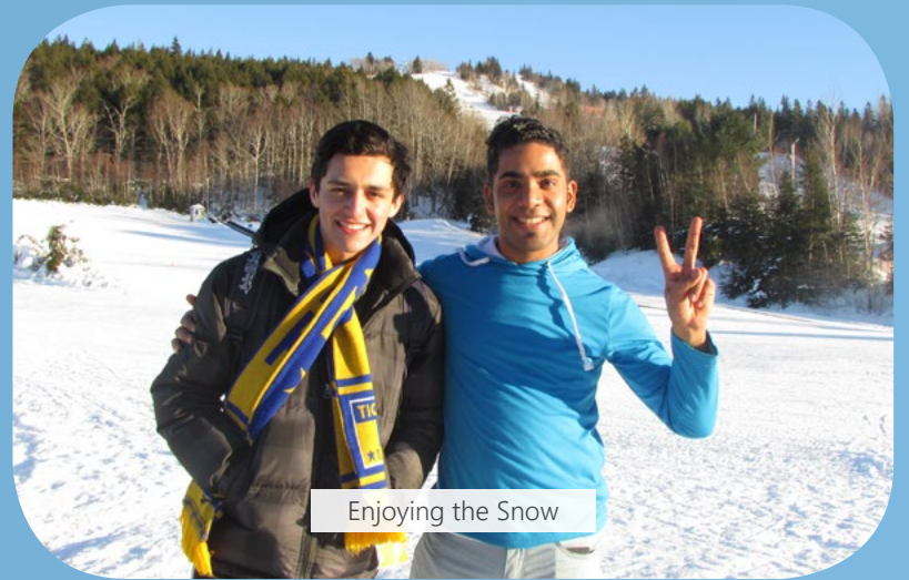
Enjoying the Snow