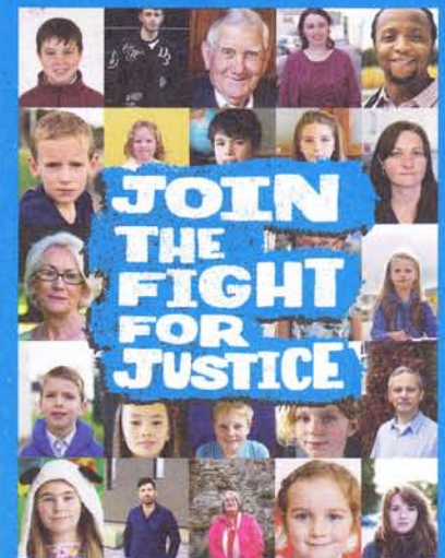
Trócaire volunteers and supporters