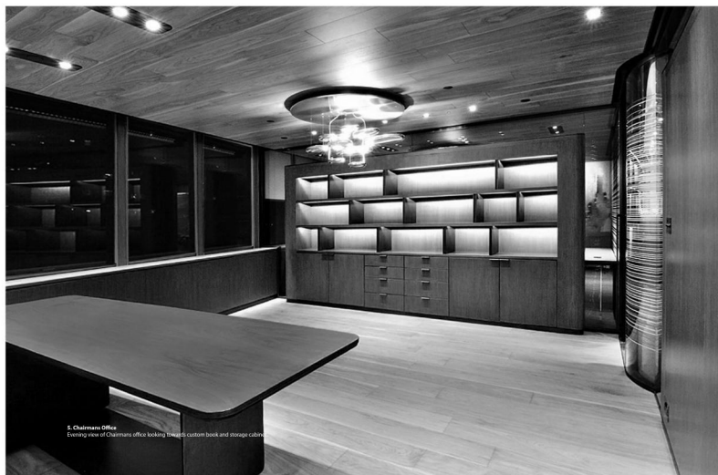
5. Chairman's Office Enormous view of Chairman's office looking towards custom built and storage cabinet.