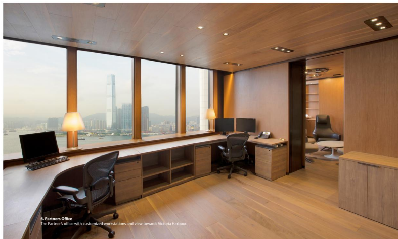
2. Partners Office The Partner's office with customized workstations and view towards Victoria Harbour.

The client brief called for inviting living room-like spaces more akin to a luxury hotel or an art gallery than a typical corporate office. Berlin-based artist Marc Bowditch created several large pieces for the office. Prime among them is a bronze-framed, 36-panel matrix of rodeo-bull watercolours on the main conference room's Venetian-plaster wall plaster. -----