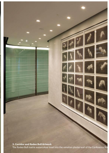
3. Corridor and Rodeo Bull Artwork The Rodeo Bull matrix watercolour inset into the venetian plaster wall of the Conference Room.