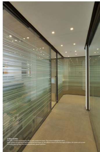
6. Glass Center The office center featuring the office and conference room. The system is highlighted with a wall of glass and a custom built and storage cabinet in the office room of the floor of glass. All corners are curved. The ceiling is a custom built and storage cabinet.