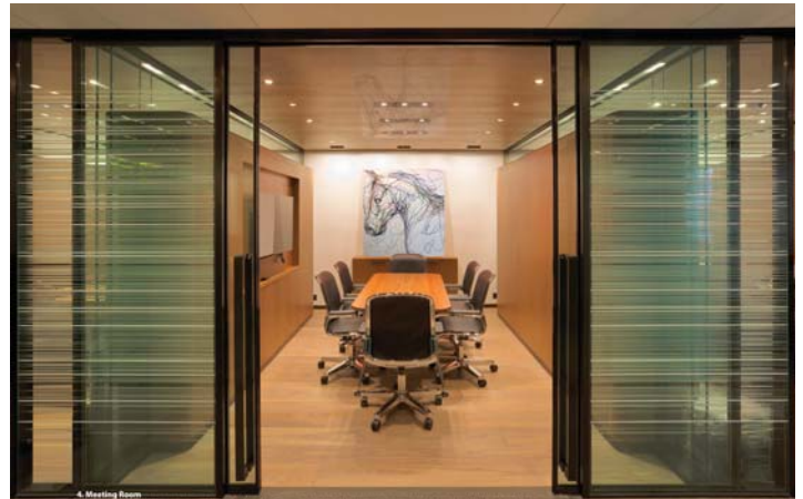
4. Meeting Room The Meeting Room finished with freestanding internal millwork cabinet, and enclosed with patterned, quartz-plate glass partitions.