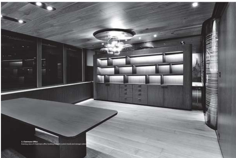
5. Chairman Office Chairman's office featuring millwork office building, custom desk and storage cabinet.