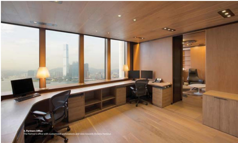
6. Partners Office The Partner's office with customized workstations and view towards Victoria Harbour.

The client brief called for inviting living room-like spaces more akin to a luxury hotel or an art gallery than a typical corporate office. Berlin-based artist Marc Bowditch created several large pieces for the office. Prime among them is a bronze-framed, 36-panel matrix of rodeo-bull watercolours on the main conference room's Venetian-plaster wall plaster. -----