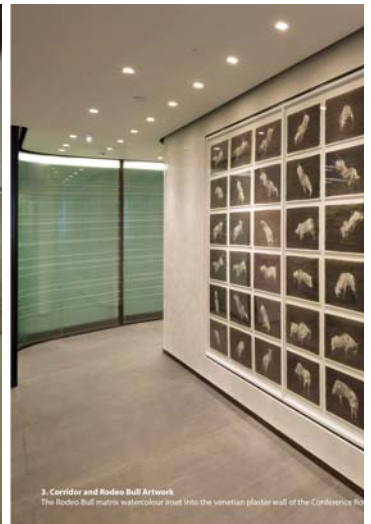
3. Corridor and Rodeo Bull Artwork The Rodeo Bull matrix watercolour burst into the venetian plaster wall of the Conference Room.