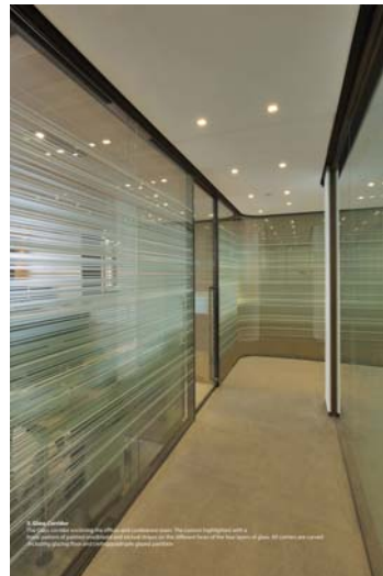
2. Millwork The millwork office building, custom desk and storage cabinet.