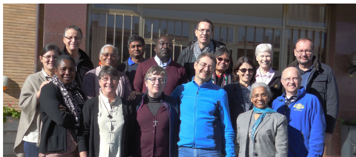
Participants at the Formation Workshop

The days provided the new JPIC Promoters with the tools needed to animate members of their congregation in justice, peace and integrity of creation (JPIC), by giving an overview of a variety of themes: the meaning of JPIC; congregational JPIC structures; the spirituality of JPIC in relation with religious vows; formation in religious life; the role of a JPIC promoter; JPIC Commission organization; networking in JPIC and a JPIC framework for planning in the congregation. One important aspect of this year's workshop was the fact that among the participants there were members of general councils from three congregations. This shows that there is a growing awareness of JPIC as an integral part of animation for their communities around the world. We had a very energizing, thoughtful and spiritually enriching time together in our efforts to promote JPIC in the life of the Congregations. The JPIC Commission Secretariat is grateful for all those who came to share their experiences in various areas of their groups and networks.