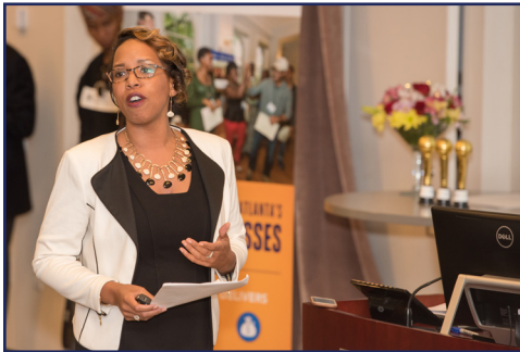
Business Skills Training

Apply by November 5 TH at startmeatl.org