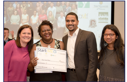
$10,000 in Grants