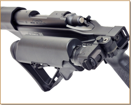
Folding Double Locking Hinge Magpul CTR Shoulder Stock