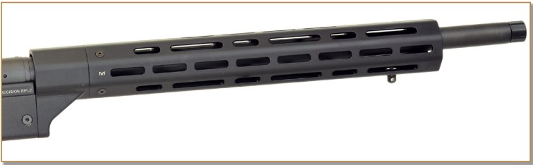
AR-08 Octagonal Alloy Modular Handguard with M-LOK Accessory Attachment System