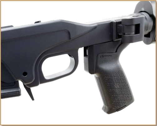
Grip-to-Trigger Distance Adjustment & Changeable Grip Angle