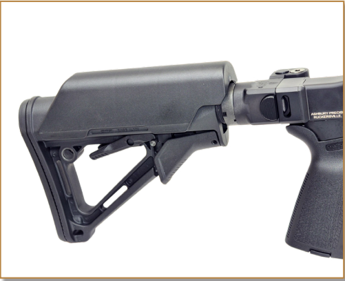
Magpul CTR 6-Position Telescoping Stock with Cheek Riser