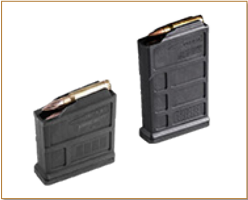
5rd AICS Pattern Magazine Standard 10rd Polymer & Steel Magazines (optional)