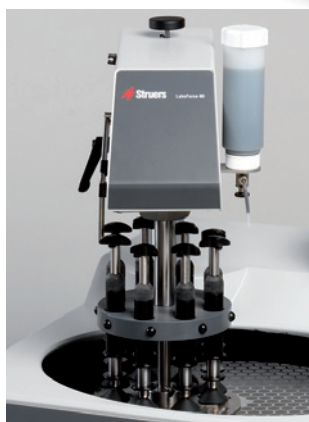
LaboForce-Mi on LaboPol-35