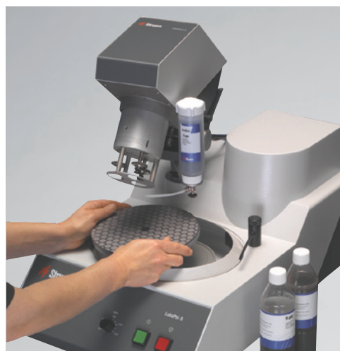
With LaboPol/LaboForce, the operator may lap, grind or polish as required through a quick and simple exchange of discs

If the number of specimens increases or if, for other reasons, the need for automation should arise, LaboPol can be automated by mounting a specimen mover, (see special brochure). With this combination, up to 3 specimens (8 on LaboForce-Mi) can be fine ground, lapped or polished simultaneously. An investment in LaboPol enables future upgrading to automation to meet the growing demands. Three different specimen movers are available.