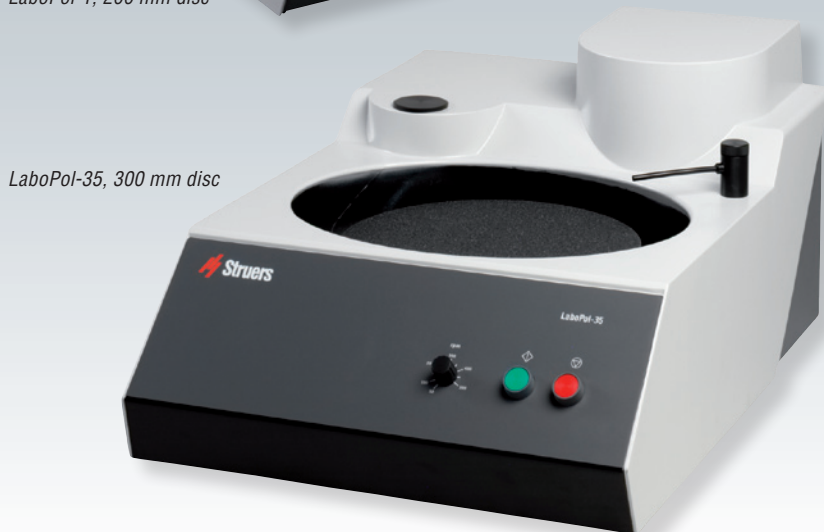
LaboPol-35, 300 mm disc