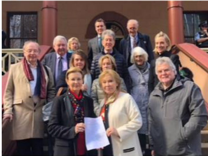
The Darling Point Society, with Vaucluse MP Gabrielle Upton, had tabled a petition against the skatepark in state parliament last month.

Woollahra Council had then moved to clarify those comments, with mayor Peter Cavanagh saying there were no plans to build more within the local government area.