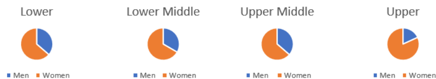
Number of men and women in each pay quartile