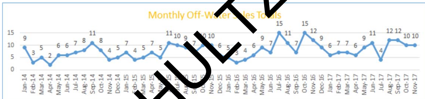
Figure 7: Off-Water Home Sales Totals by Month