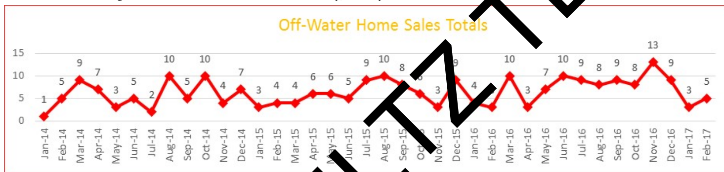
Figure 12: Off-water Home Sales by Month.