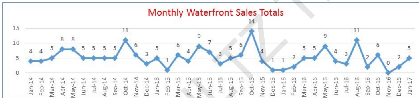
Figure 2: Waterfront Home Sales Totals by Month