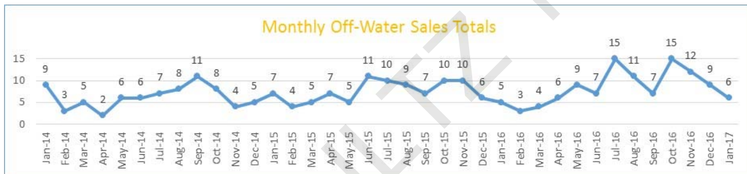
Figure 7: Off-Water Home Sales Totals by Month.