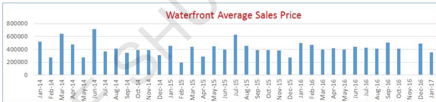
Figure 3: Waterfront Home Average Sales Price by Month.