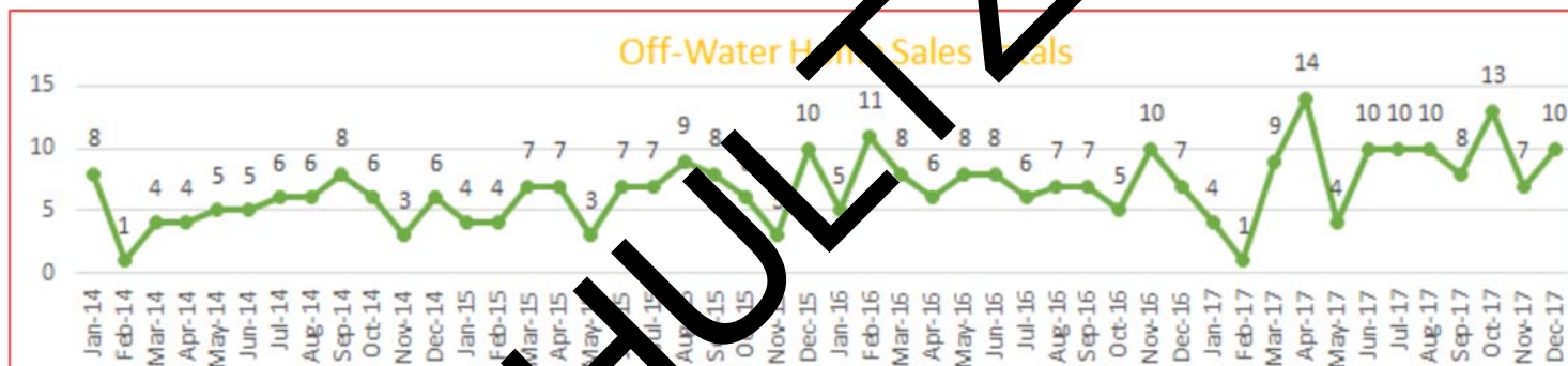
Figure 12: Off-Water Home Sales by Month.