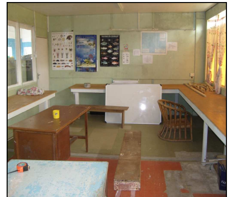
Tamnein nanon te Multi purpose room.