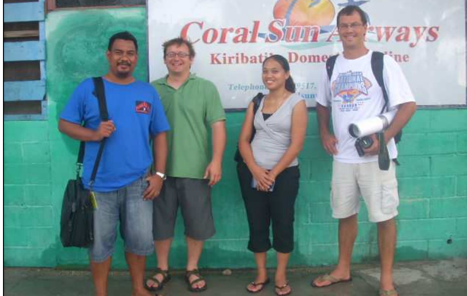
Kaain te tiim nako Mwaiana

Teuana mai buakon bwaai ake iai rekerakeia ma aron mwaingingin te tano bon te bwai ae ataaki bwa te El Nino Southern Oscillation ke ENSO.