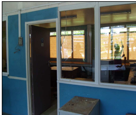
Tamneina mai tinanikuna

Iai te katautau bwa taian bun ake a uotaki ana tauraoi ni kabwakaaki inanon naman Tarawa I eta.