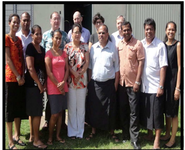
Aikai kaain te tiim n maroro mai Kiribati, Matiare, Nauru ao ai kaain te SOPAC.

Te itiatia iaon te aba bon ti te arona naba ma te itiatia i taari. Kaokoron te ititia i taari ma are iaon te aba bwa tia aikai a karaoaki rinanon te boraraoi (negotiations) n raonaki ma te mwakuri (technical work) irouia taan rabakau ake ngaiaa tabeia te itera aio.