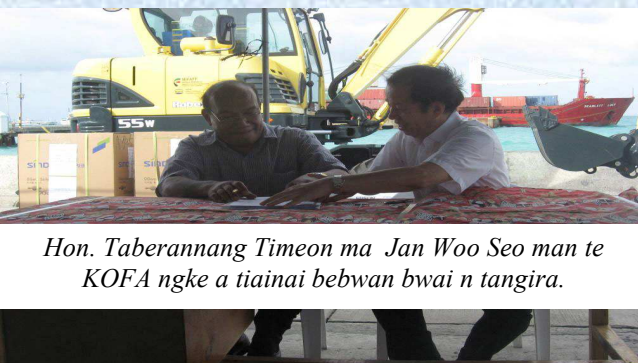
Hon. Taberannang Timeon ma Jan Woo Seo man te KOFA ngke a tiainai bebwan bwai n tangira.