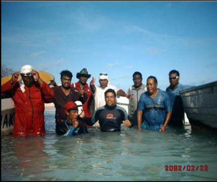
Kaain te tiim ni kakaae I aantare.