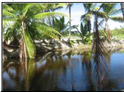
Teuana mai ibuakon neei aika a mwaiti ake a tibwa kenaki ibukin kanoan te marae ni wanikiba