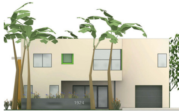
Elevation, Bougainvillea Residence, COURTESY OF TRACTION ARCHITECTURE