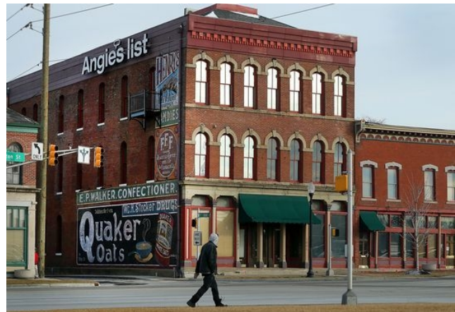
Angie's List Headquarters in Indianapolis, IN.

Strangely, there has not been much attention to this deal, and yet this potential transaction brings up several questions and valuation concerns. How can the price of Angie's List be greater than the offer in cash of $8.50 per share? Will Angie's List really benefit from the merger? How are Angie's List and HomeAdvisor compatible? With a simple analysis, we will show you why shorting this stock can be the right thing to do.