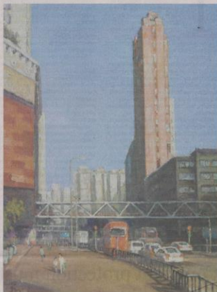
Castle Peak Road Glamour, Chan Chiu-lung

Whatever their style — realistic, impressionist or abstract — together the painters have put up an enjoyable show, giving the viewers yet another chance to feast their eyes on images of both existing and disappearing scenes of the city.