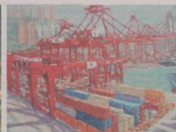
Container Port 2, Au Ka-lam

By AGNEN LEU in Hong Kong agnen@chinaaiblog.hk.com