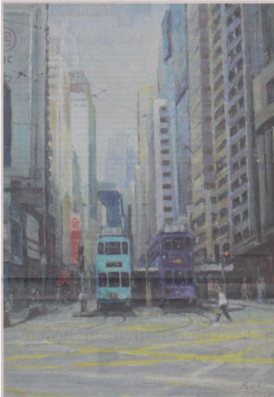
Des Voeux Road, Sheung Wan, Chan Chiu-lung, PROVIDED TO CHINA DAILY

Whatever their style — realistic, impressionist or abstract — together the painters have put up an enjoyable show, giving the viewers yet another chance to feast their eyes on images of both existing and disappearing scenes of the city.