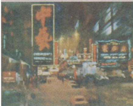
Kowloon Night , Lin Ming-chen