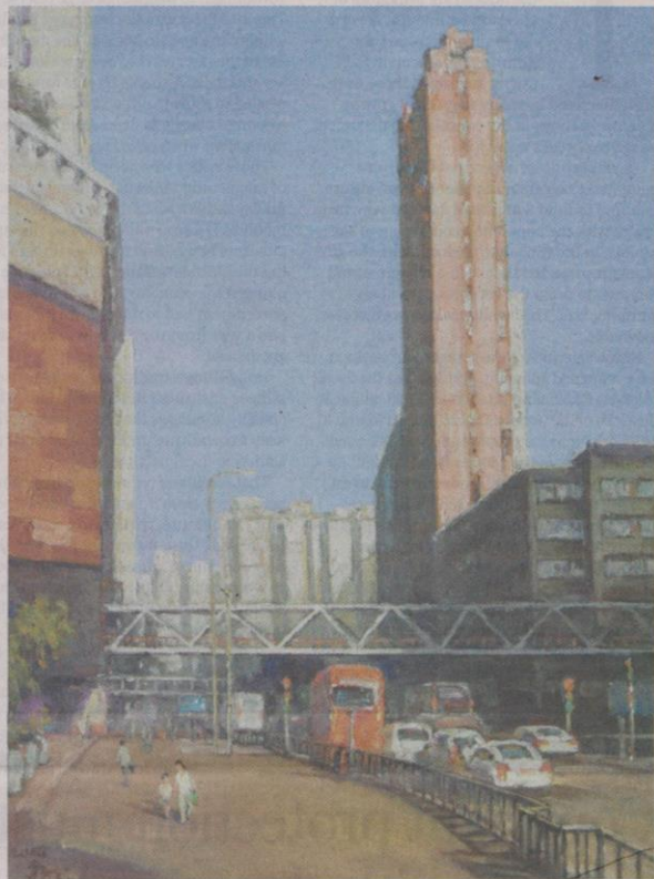
Castle Peak Road Glamour, Chan Chiu-lung