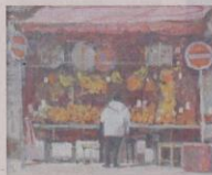
Fruit Stall, Shen Ping