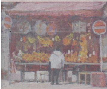
Fruit Stall , Shen Ping