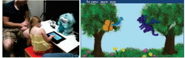
Figure 1: Experimental setup (left) and screenshot from the Story-maker app (right)

For the social robotic platform we used Dragonbot [20], a squash-and-stretch Android smartphone based robot. The facial expression, sound generation and part of the logic is generated on the smartphone, which is mounted on the face