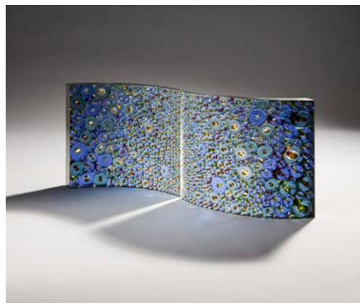
Section Pair, Neodymium Steel, Olive and Gold, 2018, blown and fused glass, stainless steel, 13.5 x 35 x 7 in