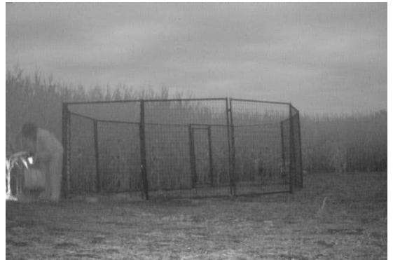
Top: Quincy Bottom: Smart 4 Paws/Find Toby in PA Volunteer, Kim, as seen on the trail camera near the trap for Quincy