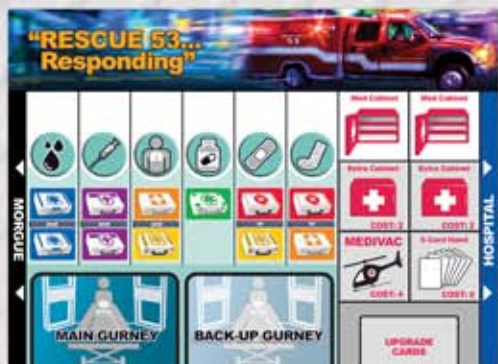
4 Ambulance player mats