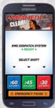
Digital Timer (app)

It is highly recommended that all players sit closely together, centered around the common play area. Your common area should look like this: