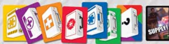
82 Supply cards

13 yellow, purple, orange, red, blue, green & 4 wild