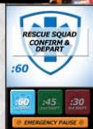
5 sec Clean Up about to end