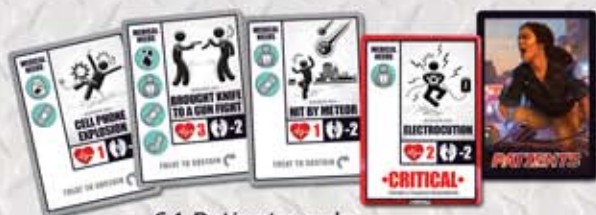
64 Patient cards

2 Extra Cabinets, 1 Medevac, 1 Hand Upgrade