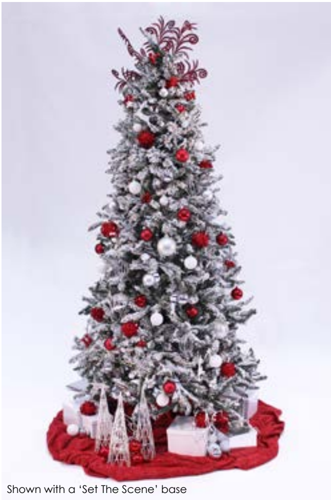
Shown with a 'Set The Scene' base