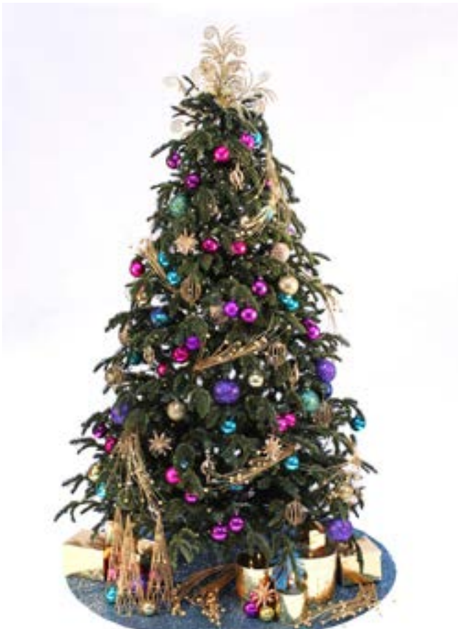
Shown with a 'Set The Scene' base