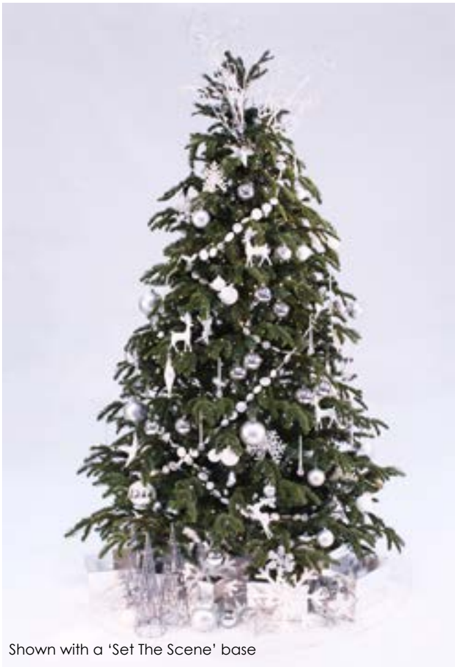
Shown with a 'Set The Scene' base