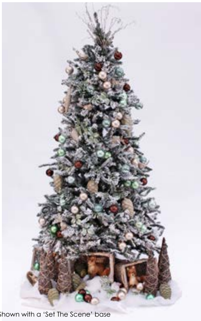
Shown with a 'Set The Scene' base