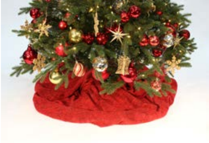
Simply Tree - A wool wrap in a colour to complement your chosen scheme