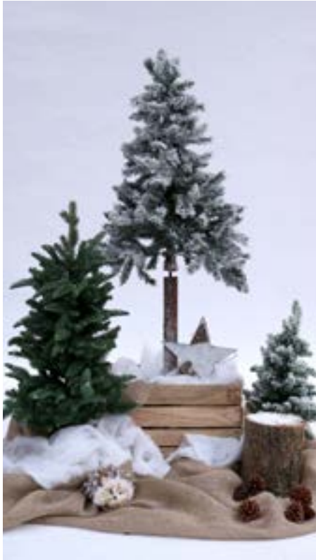
Option 1 - Frosty Corner