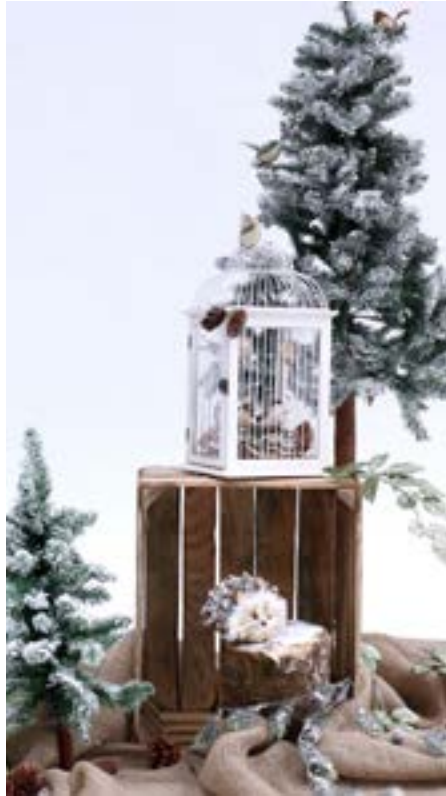
Option 2 - Mid Winter