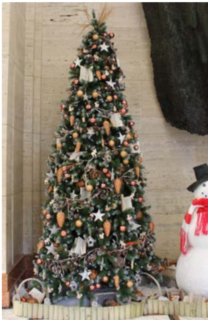
Shown as part of a scene