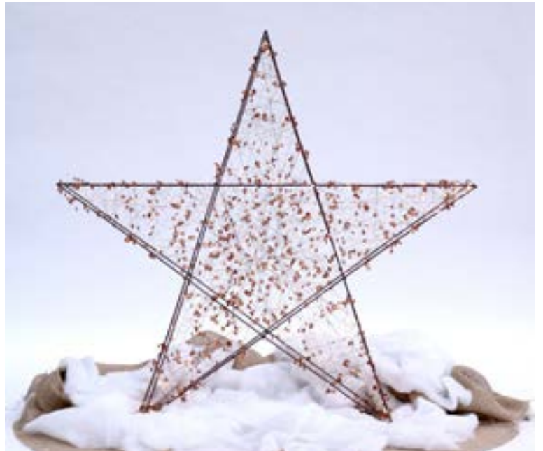
Large Lit Star