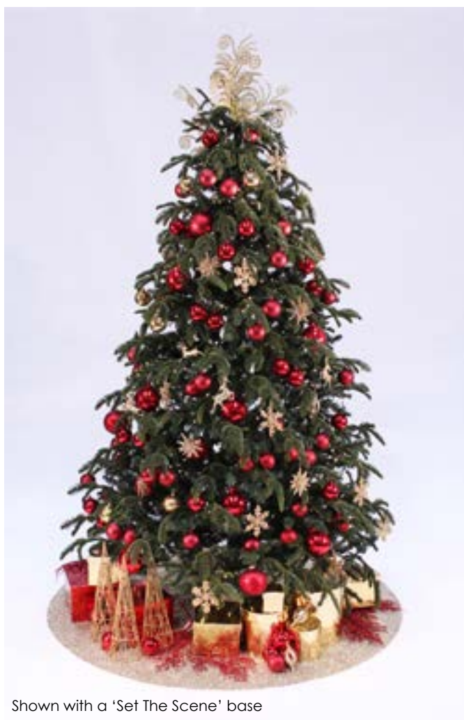
Shown with a 'Set The Scene' base