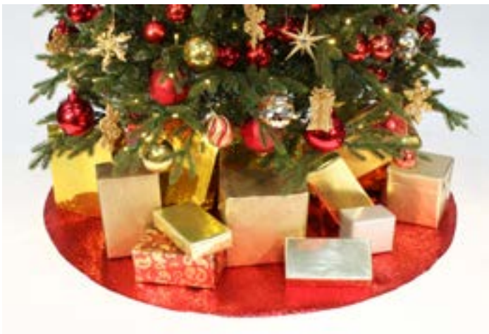
Traditional Christmas - A glitter mat and gift boxes to fit with your tree design