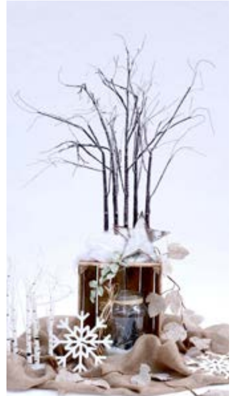
Option 3 - Narnia

Looking for something to display in a smaller space? Our focal corners are perfect for windows and smaller areas that would benefit from some festive cheer. You can choose from the options above, then add accessories and expand to suit your space.