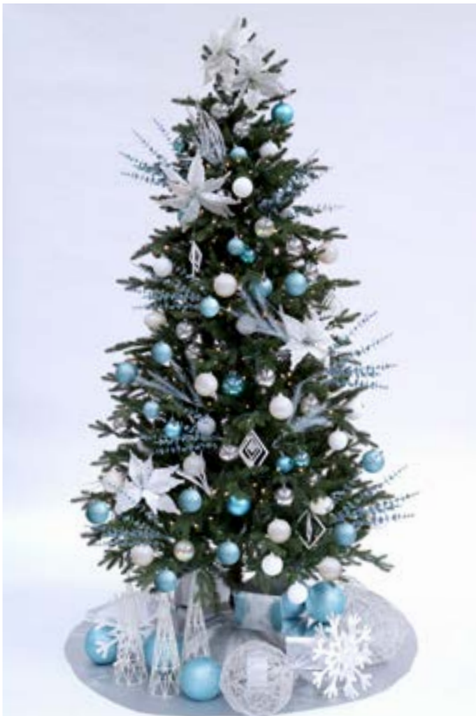
Shown with a 'Set The Scene' base