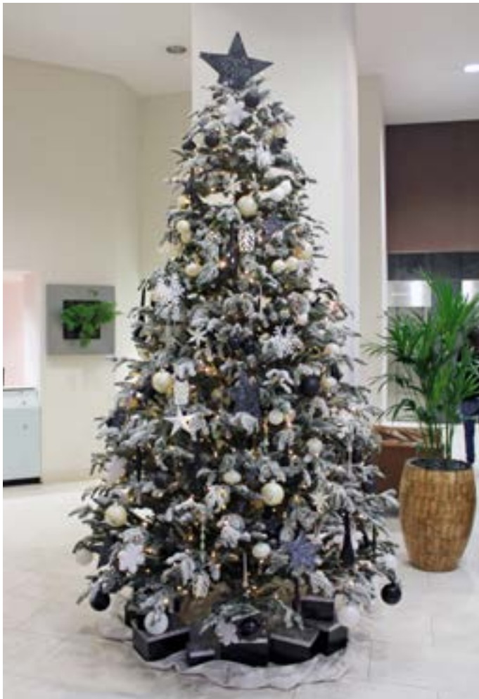
Shown with a 'Traditional Christmas' base