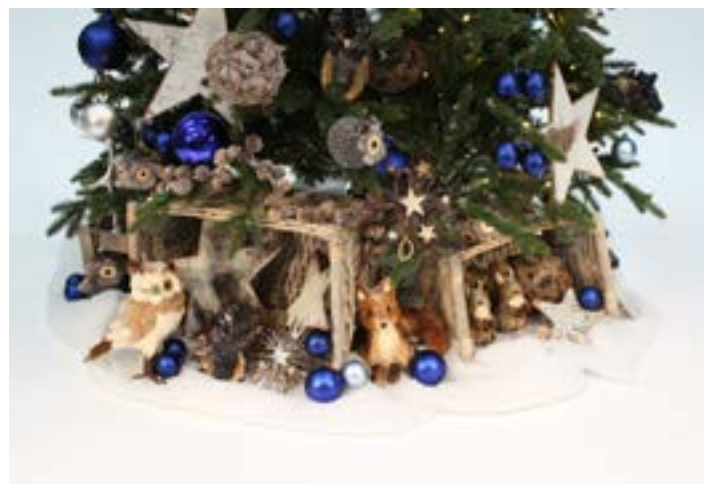
Set The Scene - A perfect mini scene at the base with props, matting, gifts and decorations