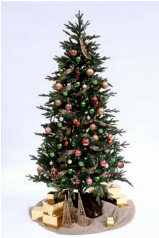
Shown with a 'Set The Scene' base