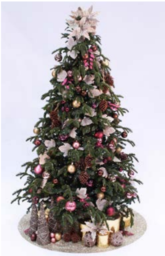
Shown with a 'Set The Scene' base